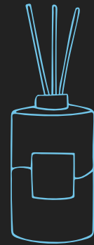
CAR & HOME ESSENTIAL OIL DIFFUSER

To get the complete positive effects of aromatherapy, essential oil should be used in its purest form without mixing them in water or using heat,